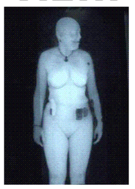
... OF <u>YOU</u>, AT HOME