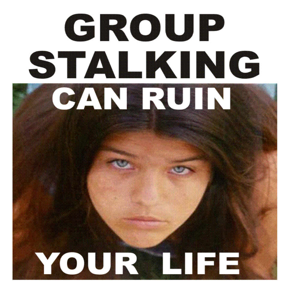
[for more information, contact, etc.]